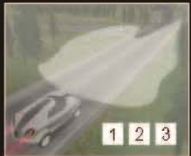
Adverse Weather Light