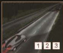
Motor Way Light