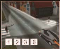
Enlarged Town Light