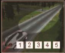
Full High Beam