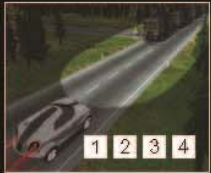
Glare Free High Beam