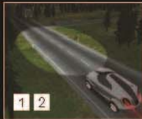
EI. Tourist Adaptation