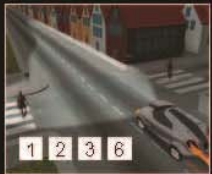
Static Bend Light